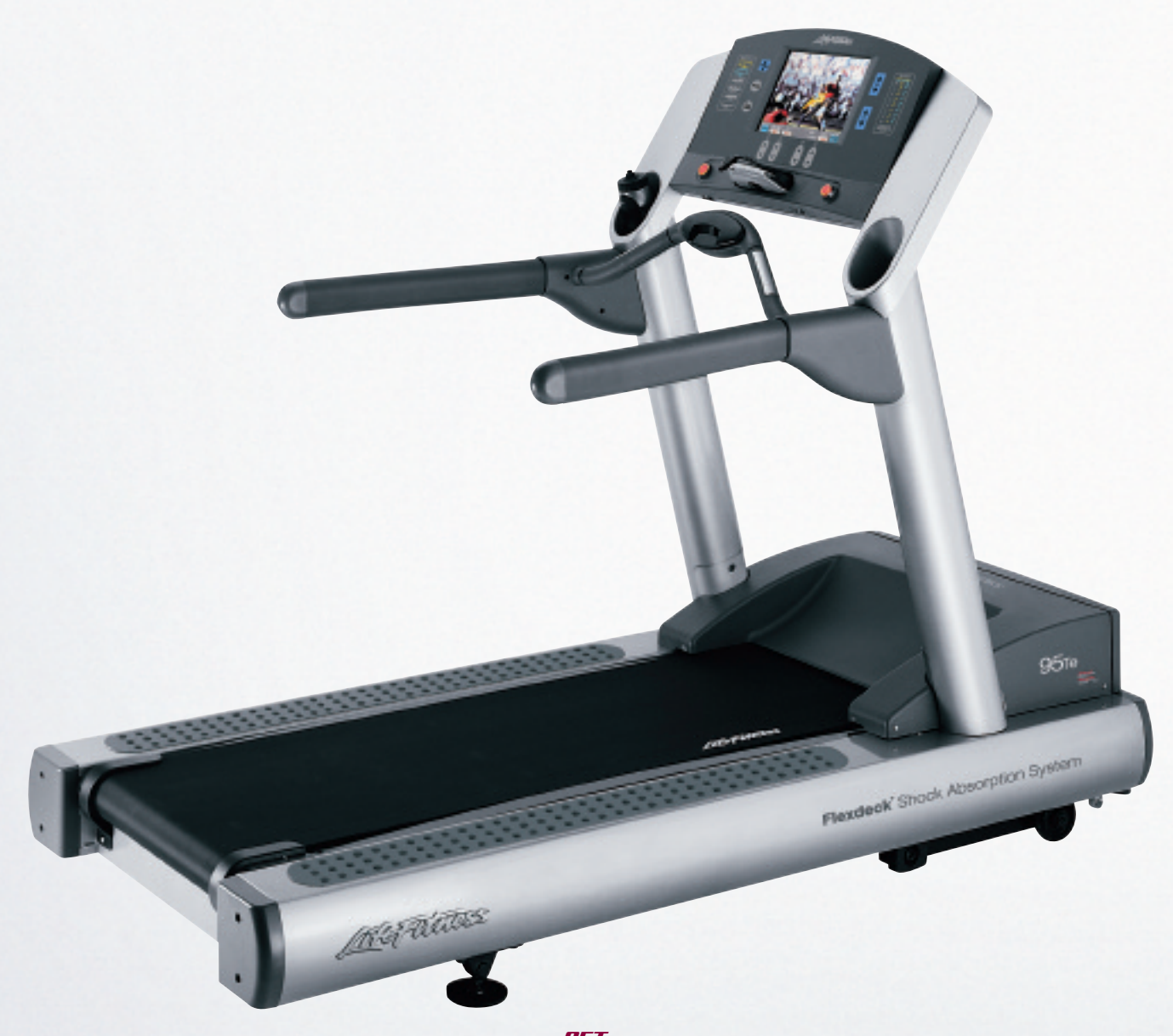
95Te E³ Integrated LEO" System